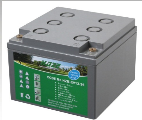
Photo shows same case size and terminal orientation

HAZE ELECTRIC VEHICLE AGM always delivers when you need it, whatever your DC requirement in general EV applications.