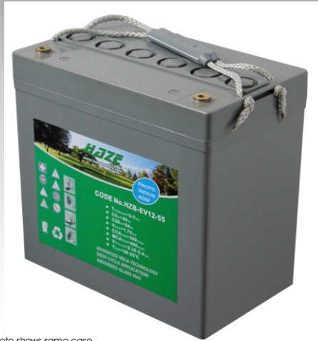
Photo shows same case size and terminal orientation

HAZE ELECTRIC VEHICLE AGM always delivers when you need it, whatever your DC requirement in general EV applications.